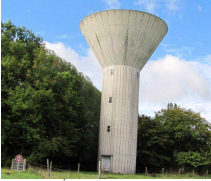
The water tower of Vanneterie