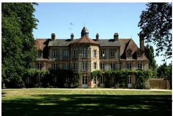
The Castle of the little Haye