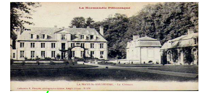
The Castle of the Big Haye